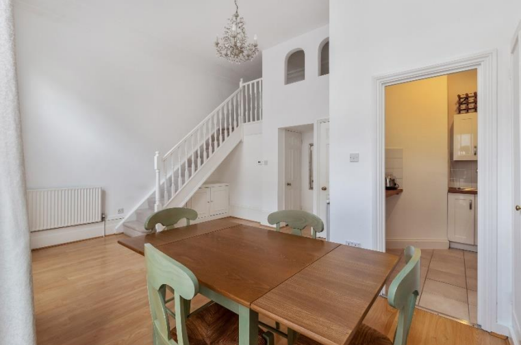
First Floor Flat | Balcony | Split-Level