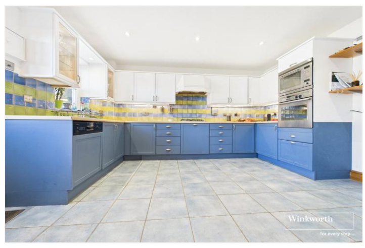
HAMILTON ROAD, BERKSHIRE, RG1 5RB OFFERS IN EXCESS OF £850,000 FREEHOLD