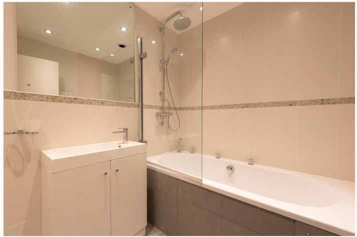
FINDON CLOSE, SW18 £2,500 PER MONTH UNFURNISHED

A spacious two bedroom house to rent in a quiet cul de sac with a private garden, ample storage and off street parking. Located within easy reach of East Putney & Southfields tube stations