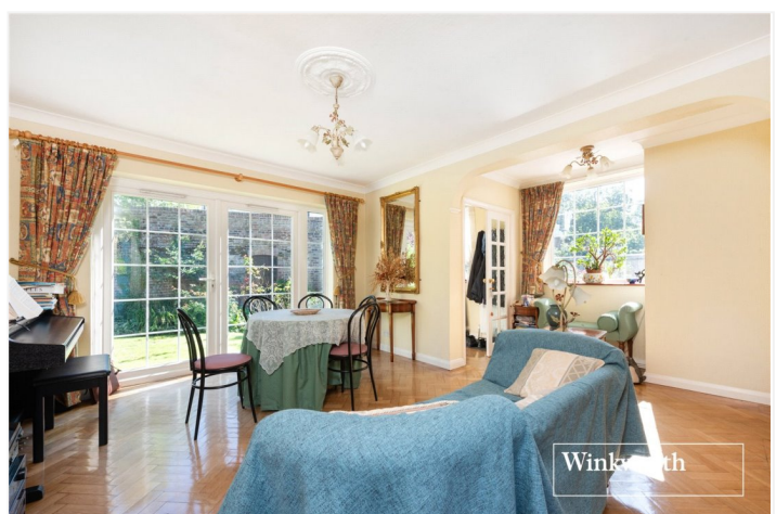
LOVERS WALK, FINCHLEY, LONDON, N3 £850,000 FREEHOLD