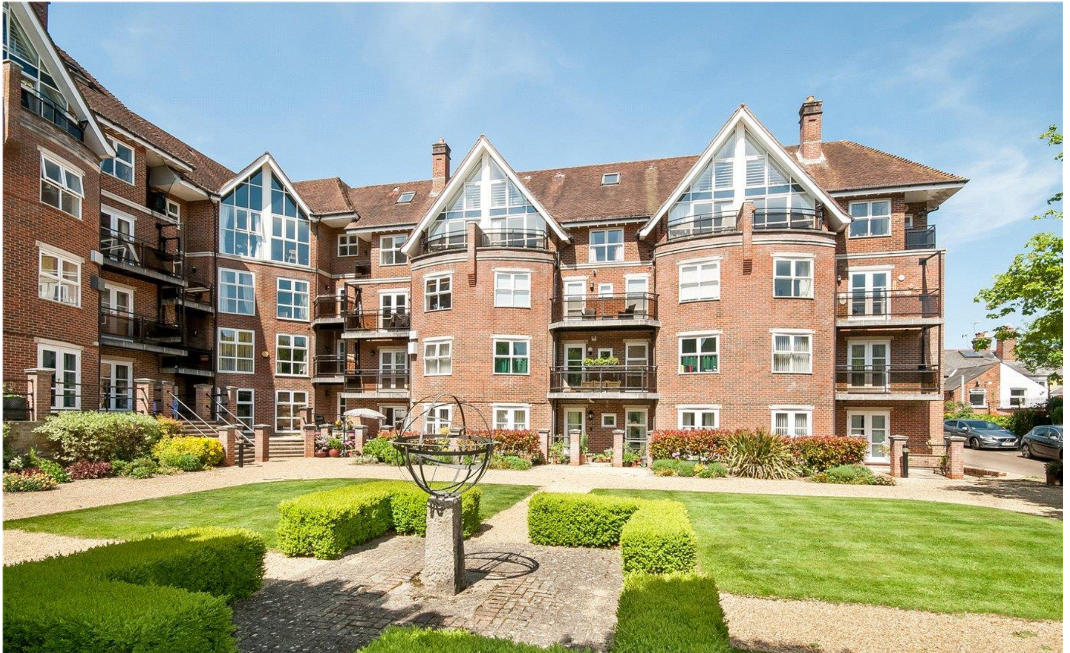
Marston Gate, Winchester, Hampshire, SO23 7DS