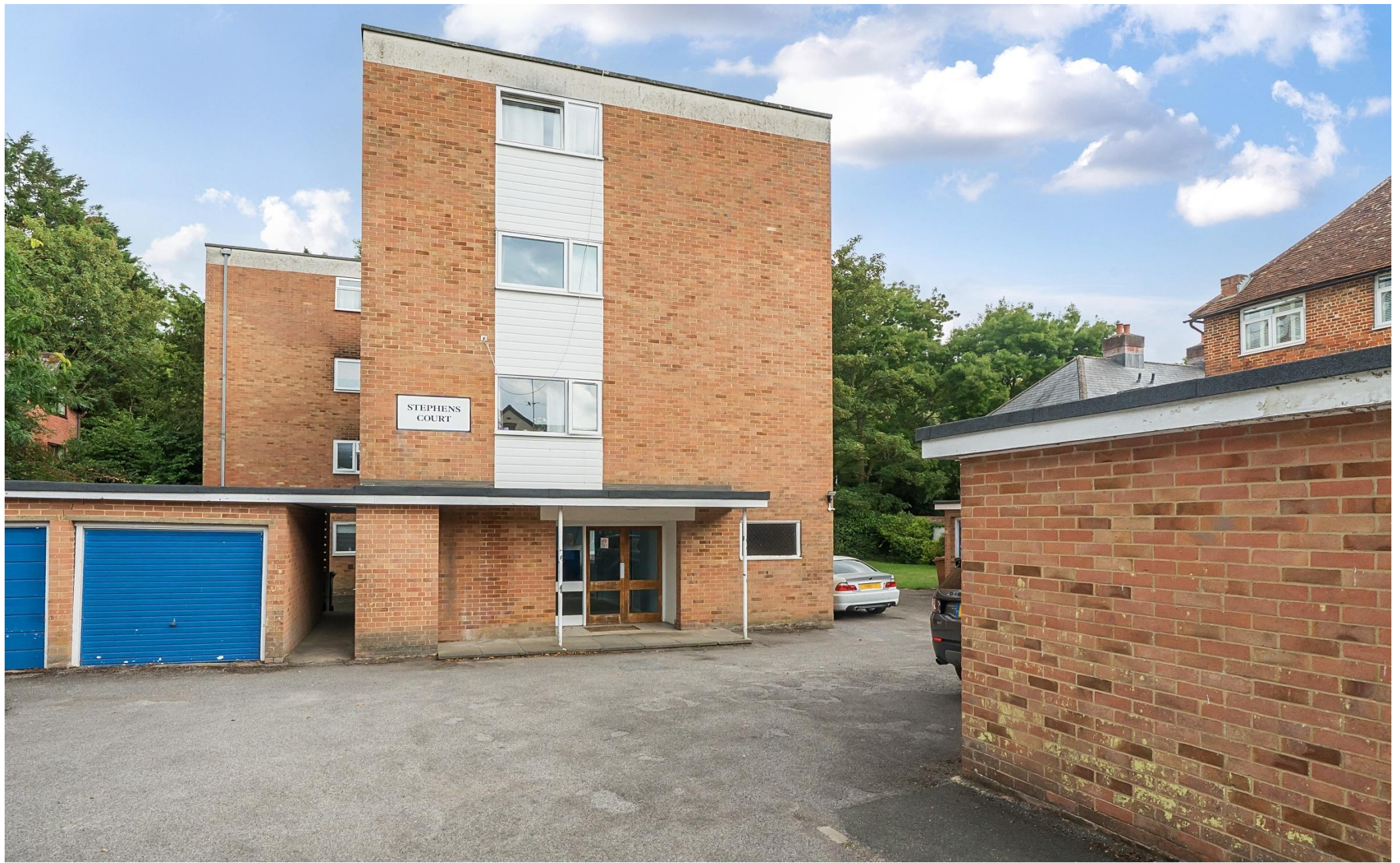
4 Stephens Court, Middlebridge Street, Romsey SO51 8HP £280,000