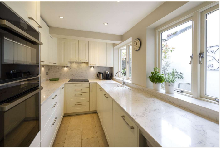
JAMESON STREET, W8 £2,000,000 FREEHOLD

AN ATTRACTIVE AND WELL PRESENTED FOUR BEDROOM VICTORIAN TERRACED HOUSE WITH REAR GARDEN.