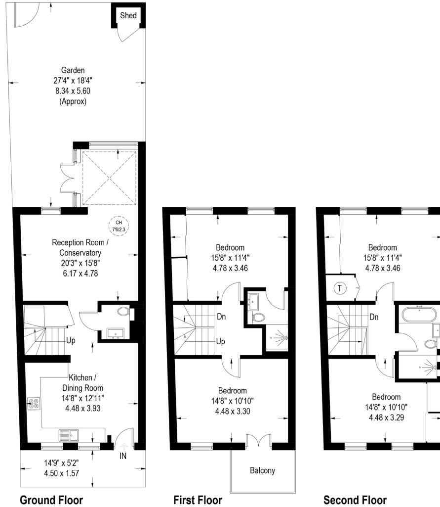
Illustration for identification purposes only, measurements are approximate, not to scale. (ID997031)