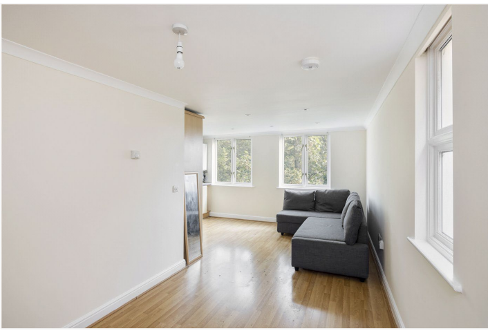
ATLANTIC ROAD, SW9 £1,425 PER MONTH PART FURNISHED