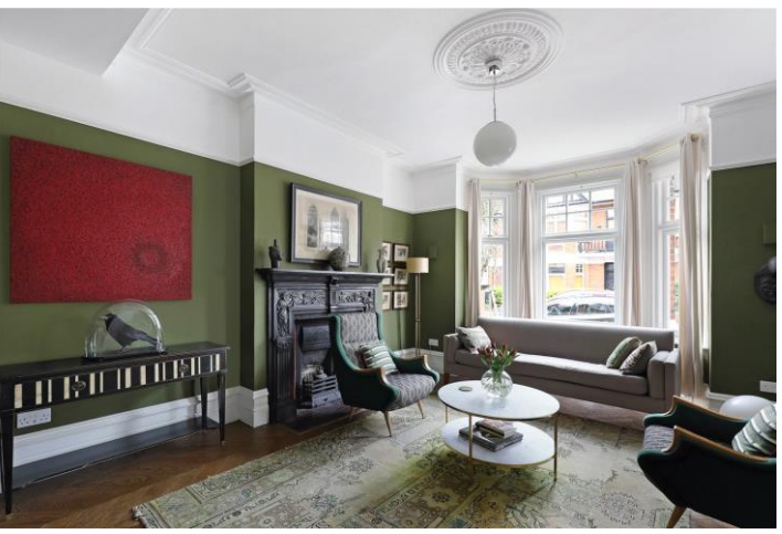
WHITEHALL GARDENS, LONDON, W3