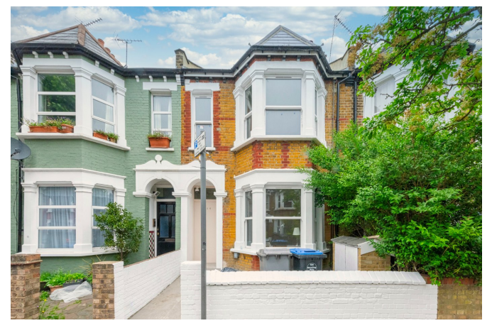
ROUNDWOOD ROAD, LONDON, NW10 £550,000 SHARE OF FREEHOLD

RENOVATED AND FULLY EXTENDED, THREE BEDROOM, TWO BATHROOM, GROUND FLOOR FLAT WITH PRIVATE REAR GARDEN AND STUDIO/SUMMERHOUSE WITH SHARE OF FREEHOLD.