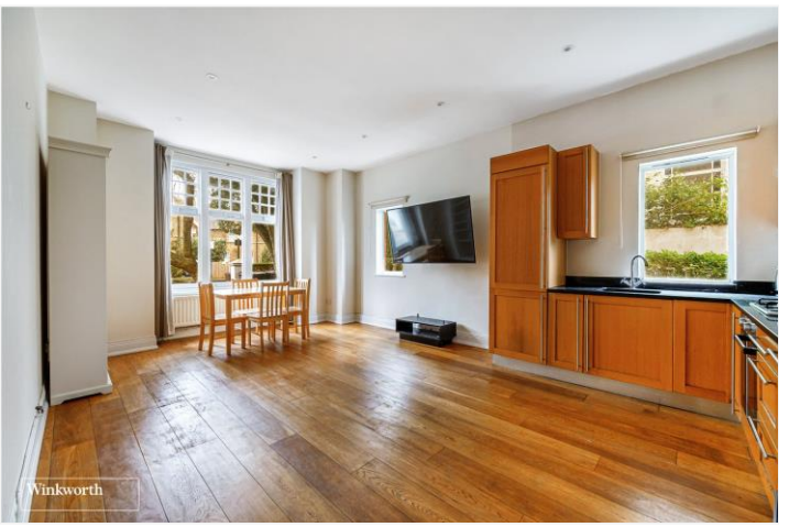
GROVE PARK ROAD, W4 £565,000 LEASEHOLD