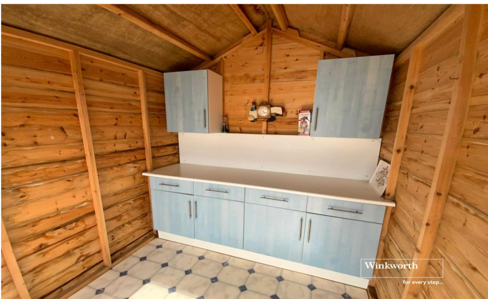
BEACH HUT 132, AVON BEACH, FRIARS CLIFF PRICE: £115,000