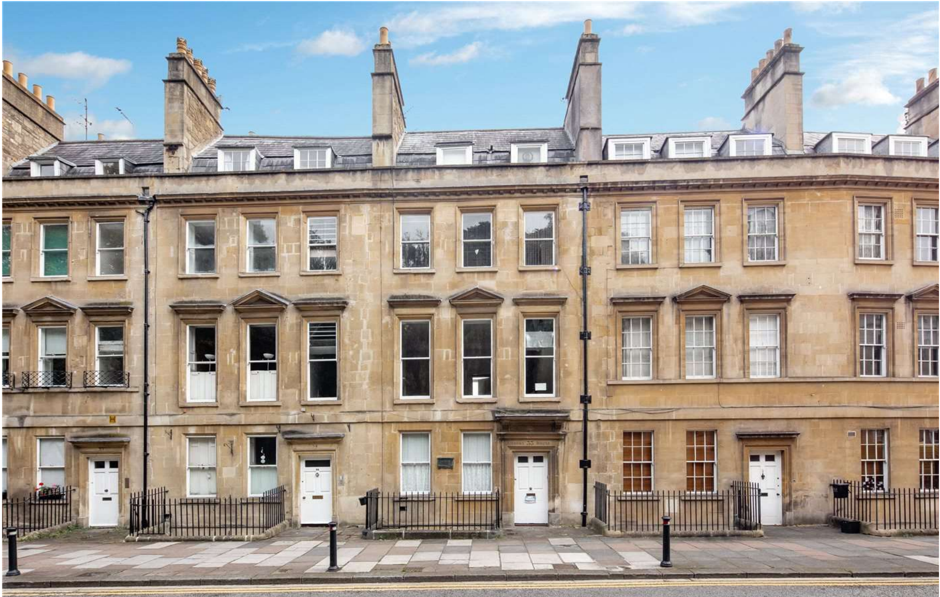
PARAGON, SOMERSET, BA1 £275,000 TO BE CONFIRMED