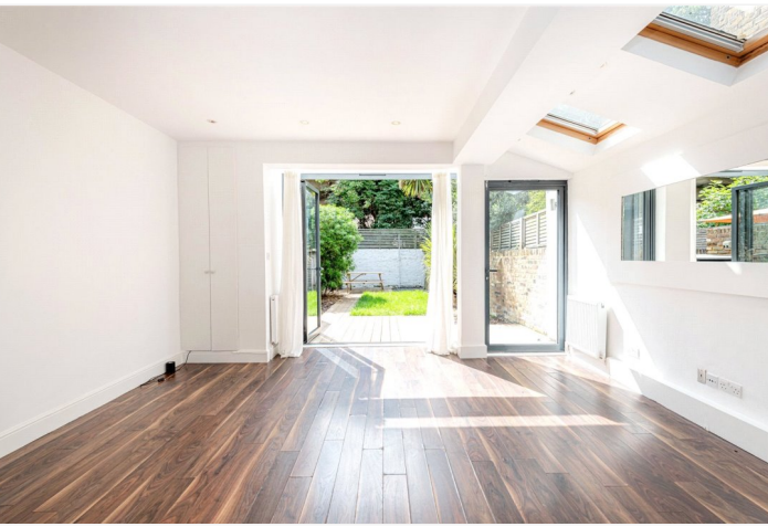
OXFORD GARDENS, LONDON, W10 £2,895 PER MONTH