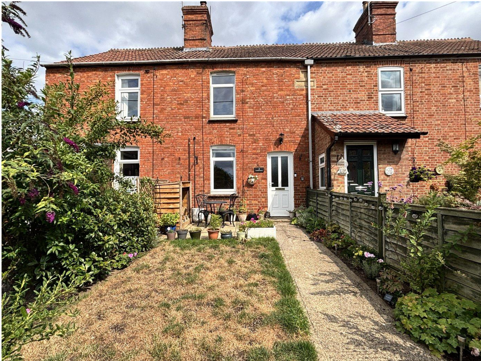
FOREFIELD TERRACE, DEVIZES, WILTSHIRE, SN10 £225,000 FREEHOLD