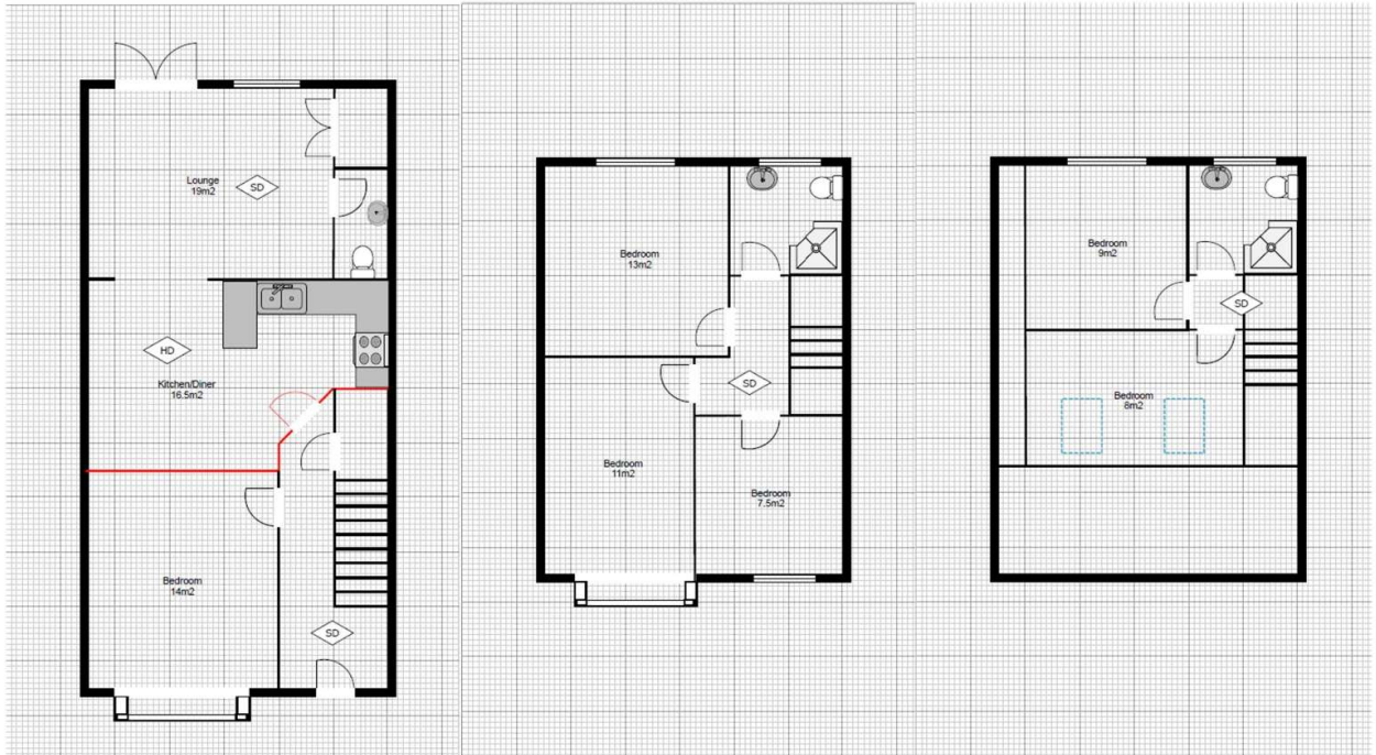
10 Fifth Avenue, Filton