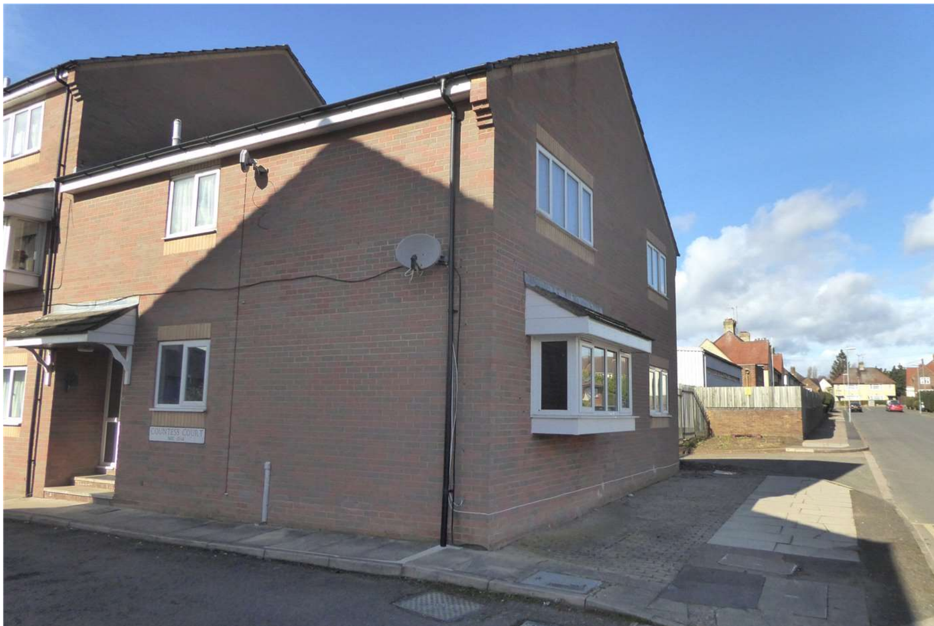
COUNTRESS COURT, NORTHAMPTON, NORTHAMPTONSHIRE, NN5 £87,000 LEASEHOLD