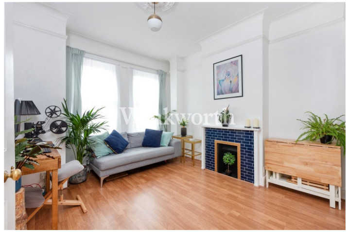
HEWITT AVENUE, N22 £635,000 TO BE ADVISED