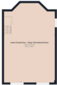
Floor -1 Building 1