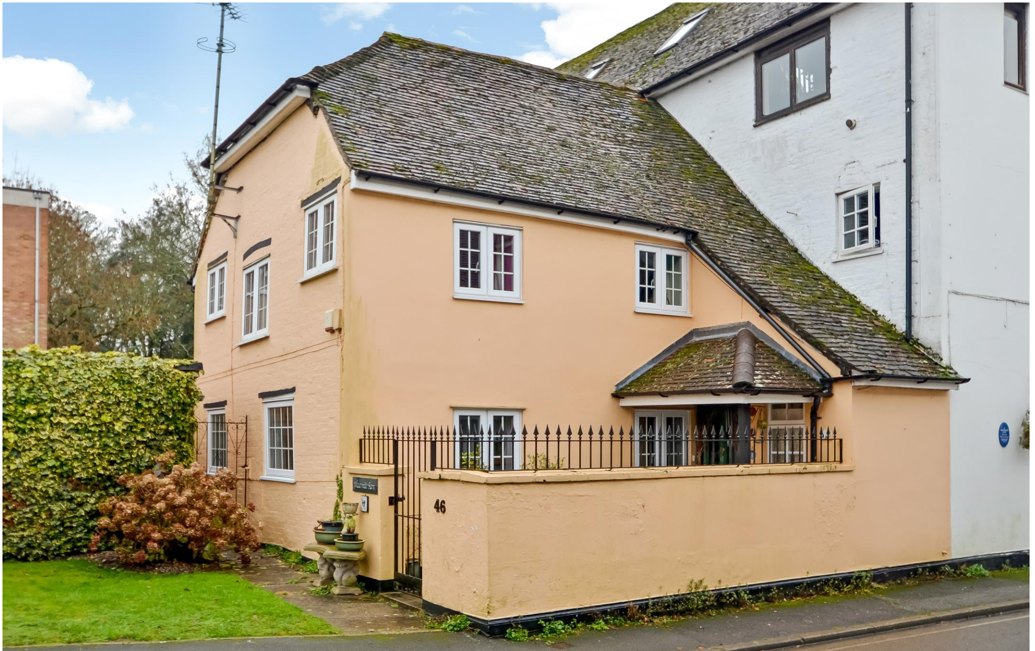
Watermill Barn, Middlebridge Street, Romsey, SO51 8HL