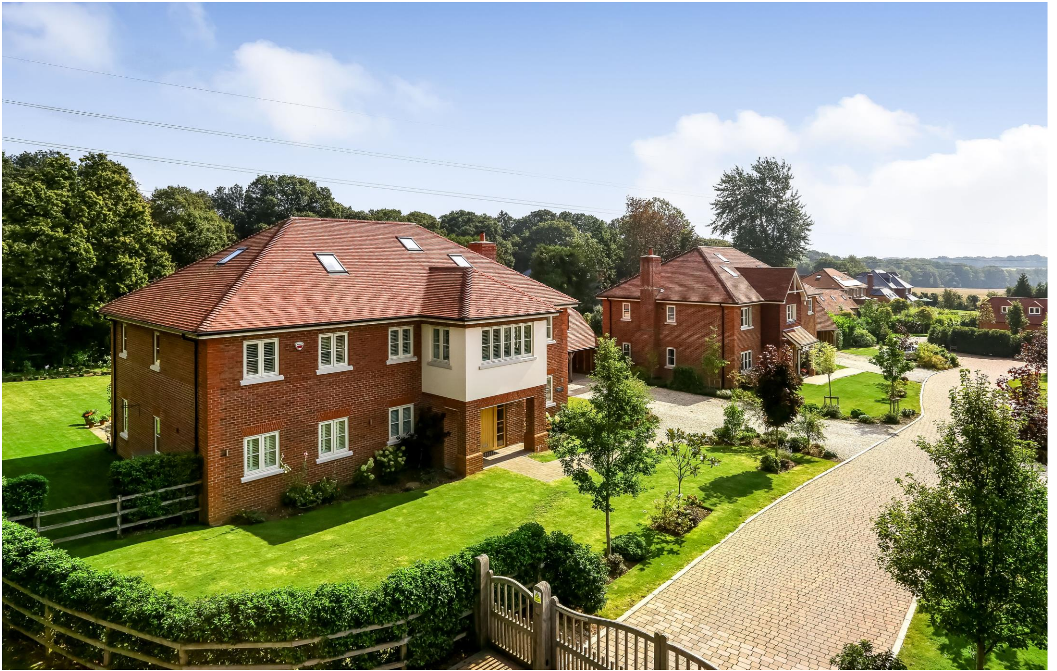
Broadgate Farm, Ampfield, Romsey, Hampshire, SO51 9AU