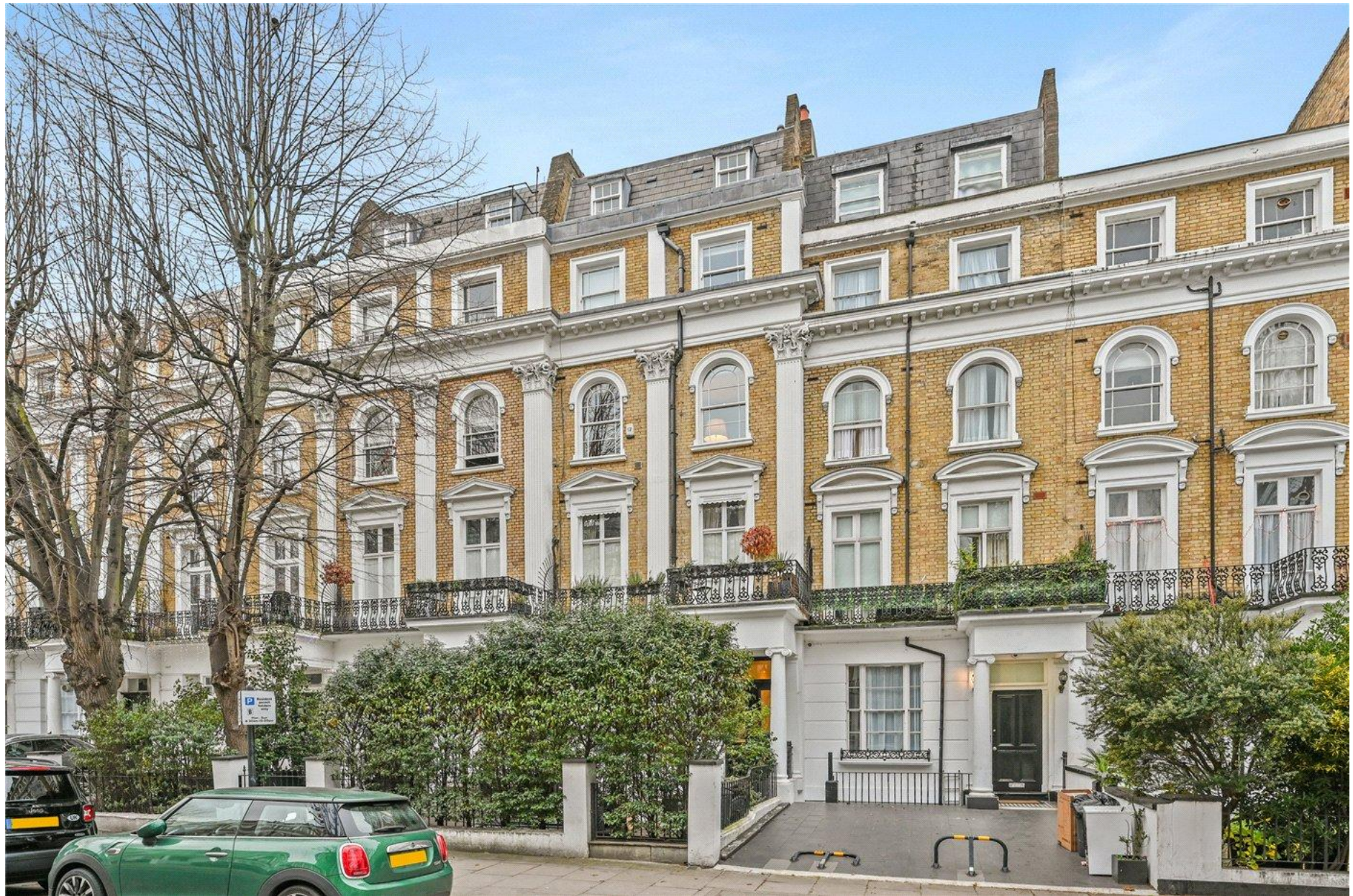
INVERNESS TERRACE, W2 £725,000 SHARE OF FREEHOLD