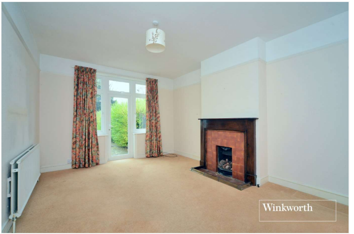
DEVON ROAD, CHEAM, SUTTON, SM2 £800,000 FREEHOLD

A SUBSTANTIAL THREE DOUBLE BEDROOM FAMILY HOME IDEALLY SITUATED IN A HIGHLY SOUGHT AFTER ROAD CLOSE TO CHEAM VILLAGE