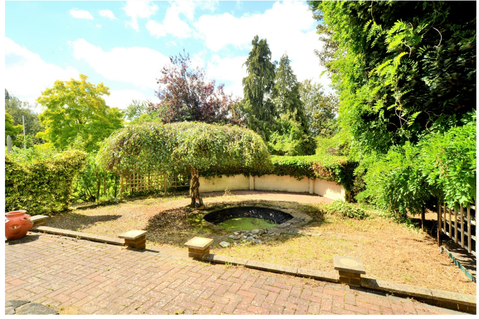
Under the Consumer Protection Regulations 2008, these Particulars are a guide and act as information only. All details are given in good faith and are believed to be correct at time of printing. Winkworth give no representation as to their accuracy and potential purchasers or tenants must satisfy themselves by inspection or otherwise as to their correctness. No employee of Winkworth has authority to make or give any representation or warranty in relation to this property.