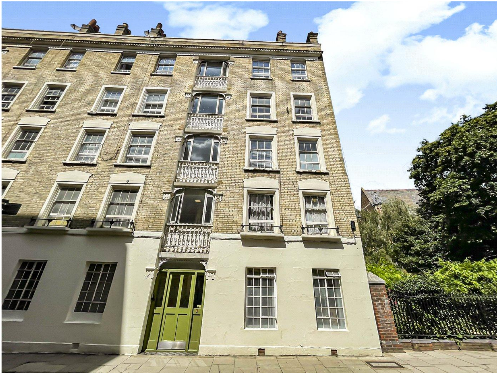
VICTORIA CHAMBERS, LUKE STREET, EC2A £400,000 SHARE OF FREEHOLD