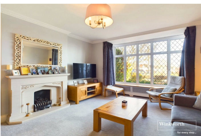
LITTLETON CRESCENT, HARROW, MIDDLESEX, HA1 £1,700,000 FREEHOLD