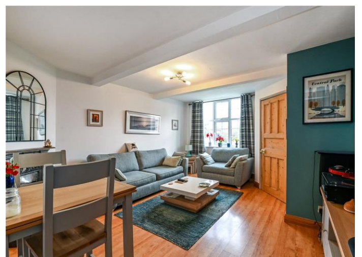
Flat 1, Dolphin Lodge, Grand Avenue, Worthing, West Sussex, BN11 5AL Asking Price £325,000

With the beach and the promenade just across the road this ground floor, two bedroom maisonette is ideally situated for all Worthing has to offer.