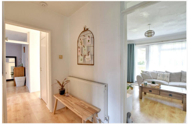
BEACONSFIELD CLOSE, BLACKHEATH, LONDON, SE3 7LH £450,000 LEASEHOLD

SPANNING ALMOST 800 SQ FT. AND WITH RARELY AVAILABLE DIRECT ACCESS TO THE COMMUNAL GARDENS IS THIS WELL PRESENTED THREE BEDROOM GROUND FLOOR APARTMENT, SOLD CHAIN FREE.