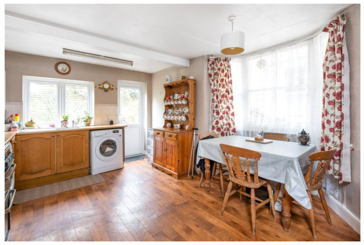
LISTRIA PARK, LONDON, N16 £1,000,000 FREEHOLD