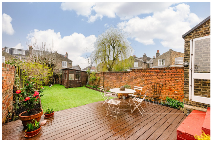
RIDLEY ROAD, LONDON, NW10 £599,950 LEASEHOLD

A VERY WELL PRESENTED TWO/THREE BEDROOM, GROUND FLOOR FLAT, WITH FULL PRIVATE GARDEN, ON A SOUGHT AFTER ROAD IN KENSAL RISE!