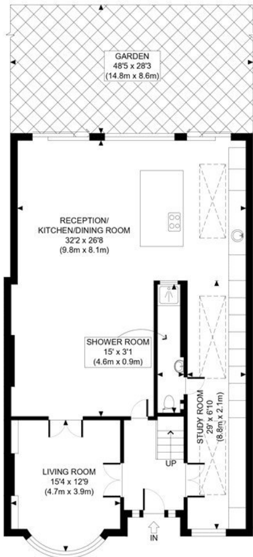
GROUND FLOOR GROSS INTERNAL FLOOR AREA 1229 SQ FT