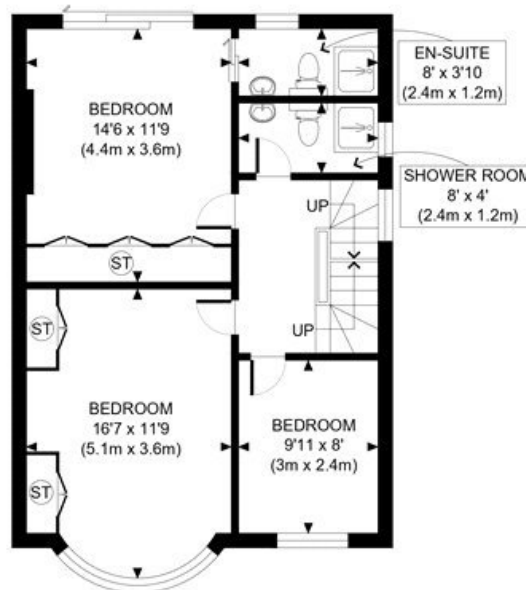
FIRST FLOOR GROSS INTERNAL FLOOR AREA 600 SQ FT

APPROX. GROSS INTERNAL FLOOR AREA WITH EAVES: 2364 SQ FT/ 220 SQM APPROX. GROSS INTERNAL FLOOR AREA WITHOUT EAVES: 2321 SQ FT/ 216 SQM