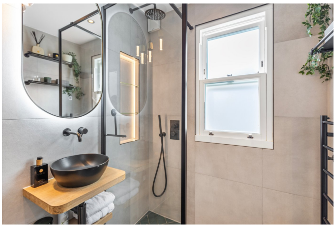
BOLTON GARDENS, LONDON, NW10 £899,950 SHARE OF FREEHOLD

A CONTEMPORARY TWO DOUBLE BEDROOM, TWO BATHROOM, SPLIT LEVEL FLAT WITH PRIVATE GARDEN NESTLED IN THE HEART OF KENSAL RISE.