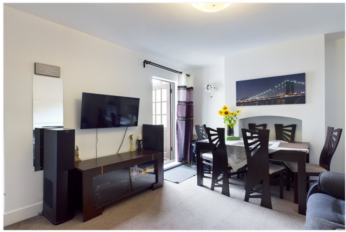
MOUNT PLEASANT, BERKSHIRE, RG1 2TF GUIDE PRICE £400,000 FREEHOLD