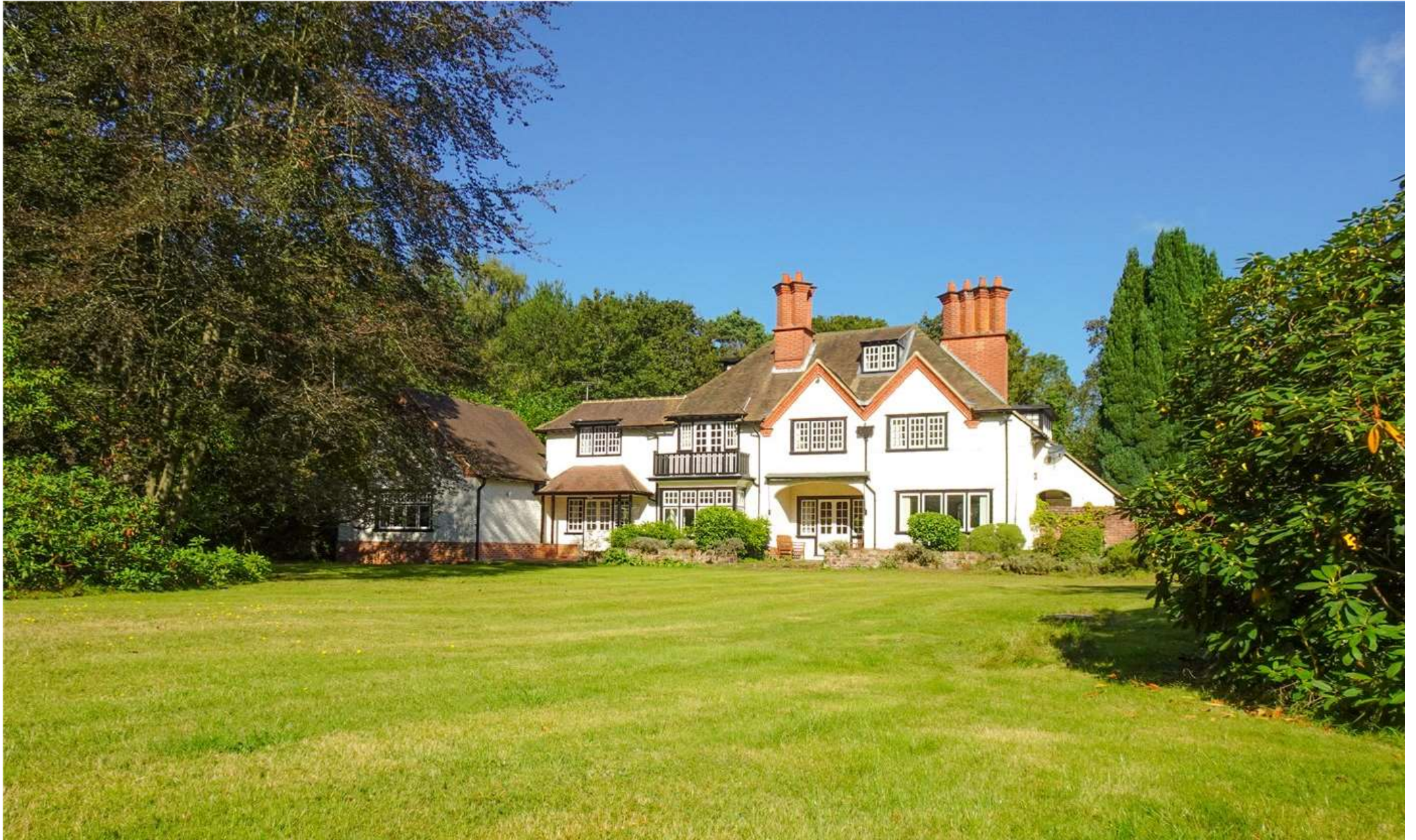
MOYLE HOUSE, FLEET HILL, FINCHAMPSTEAD, WOKINGHAM, BERKSHIRE, RG40 4LJ £2,250,000 FREEHOLD