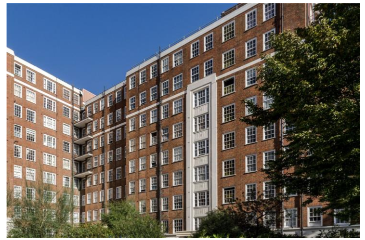
PARK WEST, EDGWARE ROAD, NR CONNAUGHT VILLAGE, W2 £750,000 LEASEHOLD 81 YEARS 10 MONTHS

A WELL-PROPORTIONED LIGHT AND SOUTH-WEST FACING, FIRST FLOOR (WITH LIFT) TWO DOUBLE BEDROOM APARTMENT LOCATED WITHIN THIS POPULAR ART DECO 1930'S BLOCK.