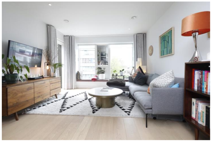
FEATHERSTONE STREET, LONDON, EC1Y £925,000 LEASEHOLD APPROX. 242 YEARS REMAINING

A MODERN TWO BEDROOM, TWO BATHROOM FOURTH FLOOR APARTMENT WITH A PRIVATE BALCONY SET IN A PRIME CLERKENWELL LOCATION.