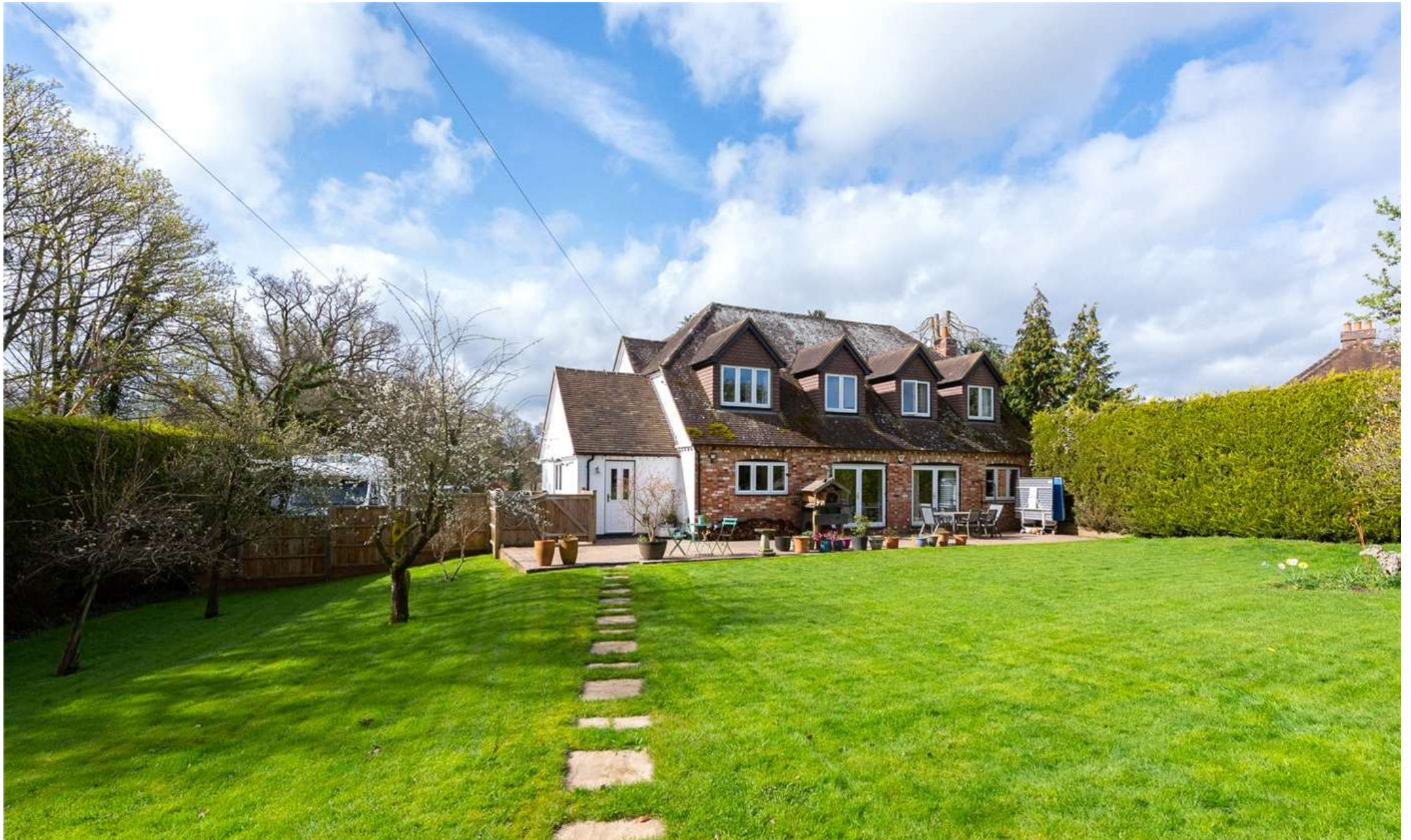
AZALEA COTTAGE, FLEET HILL, FINCHAMPSTEAD, WOKINGHAM, BERKSHIRE, RG40 4LB £1,500,000 FREEHOLD