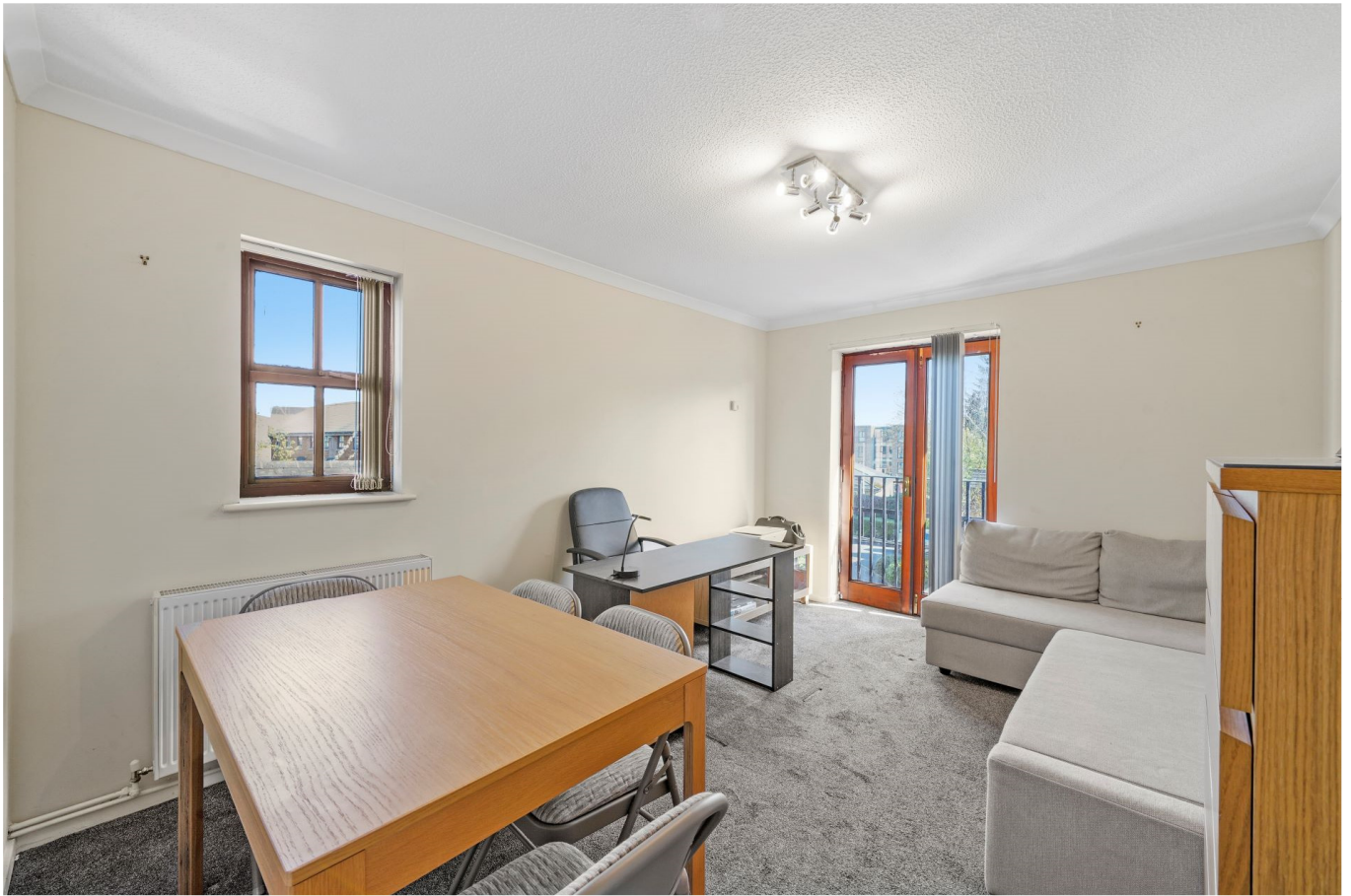
A view from reception room