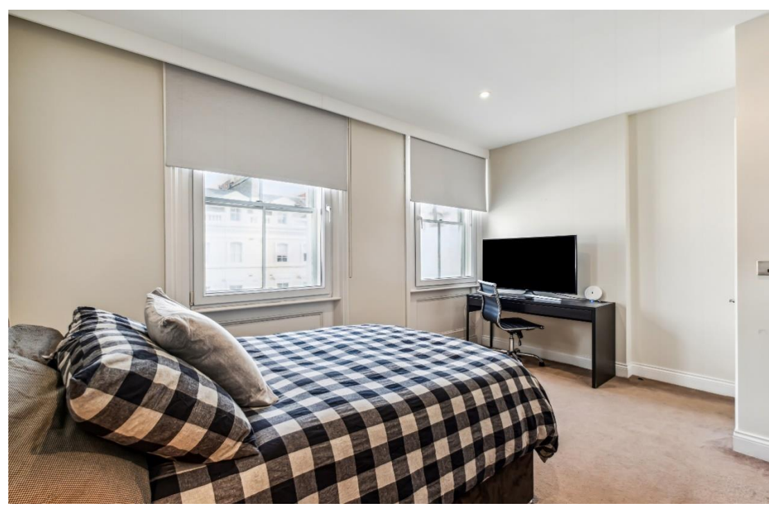
Share of Freehold | Two Double Bedrooms | Communal Gardens