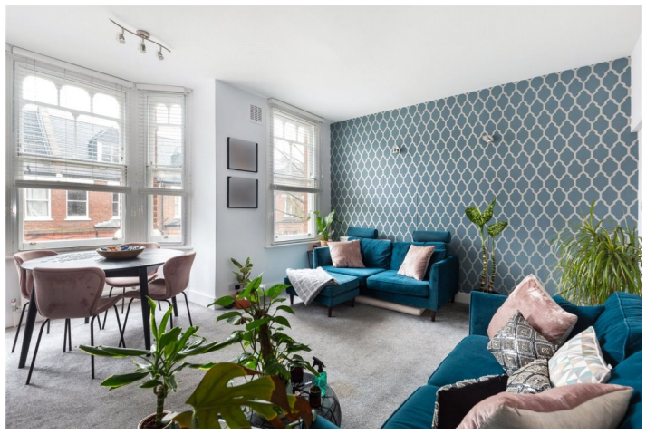
FLAT C, HORSELL ROAD, LONDON, N5 £800,000 LEASEHOLD