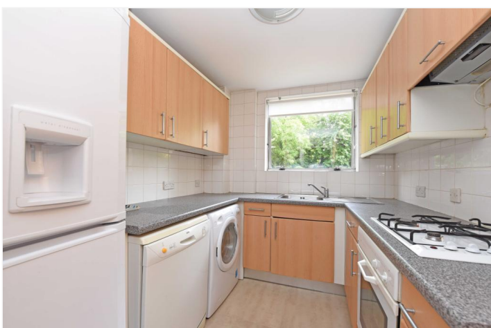
LORNE COURT, LONDON, SW15 £2,250 PER MONTH FURNISHED

A well-presented, ground floor two double bedroom purpose built property located in a popular residential development in the heart of SW15