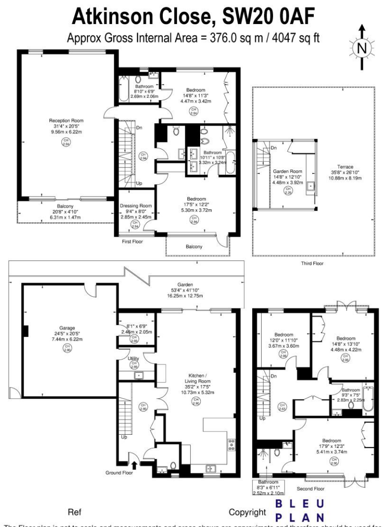
The Floor plan is not to scale and measurements and areas shown are approximate and therefore should be used for illustrative purposes only. The plan has been prepared in accordance with the RICS code of Measuring Practice and whilst we have confidence in the information produced it must not be relied on. If there is any aspect of particular importance, you should carry out or commission your own inspection of the property. Copyright @ BLEUPLAN