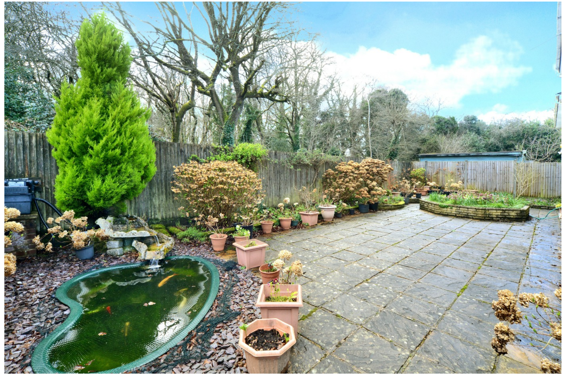
Under the Consumer Protection Regulations 2008, these Particulars are a guide and act as information only. All details are given in good faith and are believed to be correct at time of printing. Winkworth give no representation as to their accuracy and potential purchasers or tenants must satisfy themselves by inspection or otherwise as to their correctness. No employee of Winkworth has authority to make or give any representation or warranty in relation to this property.