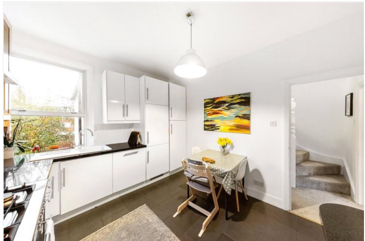
OXFORD GARDENS, W4 £2,500 PER MONTH UNFURNISHED