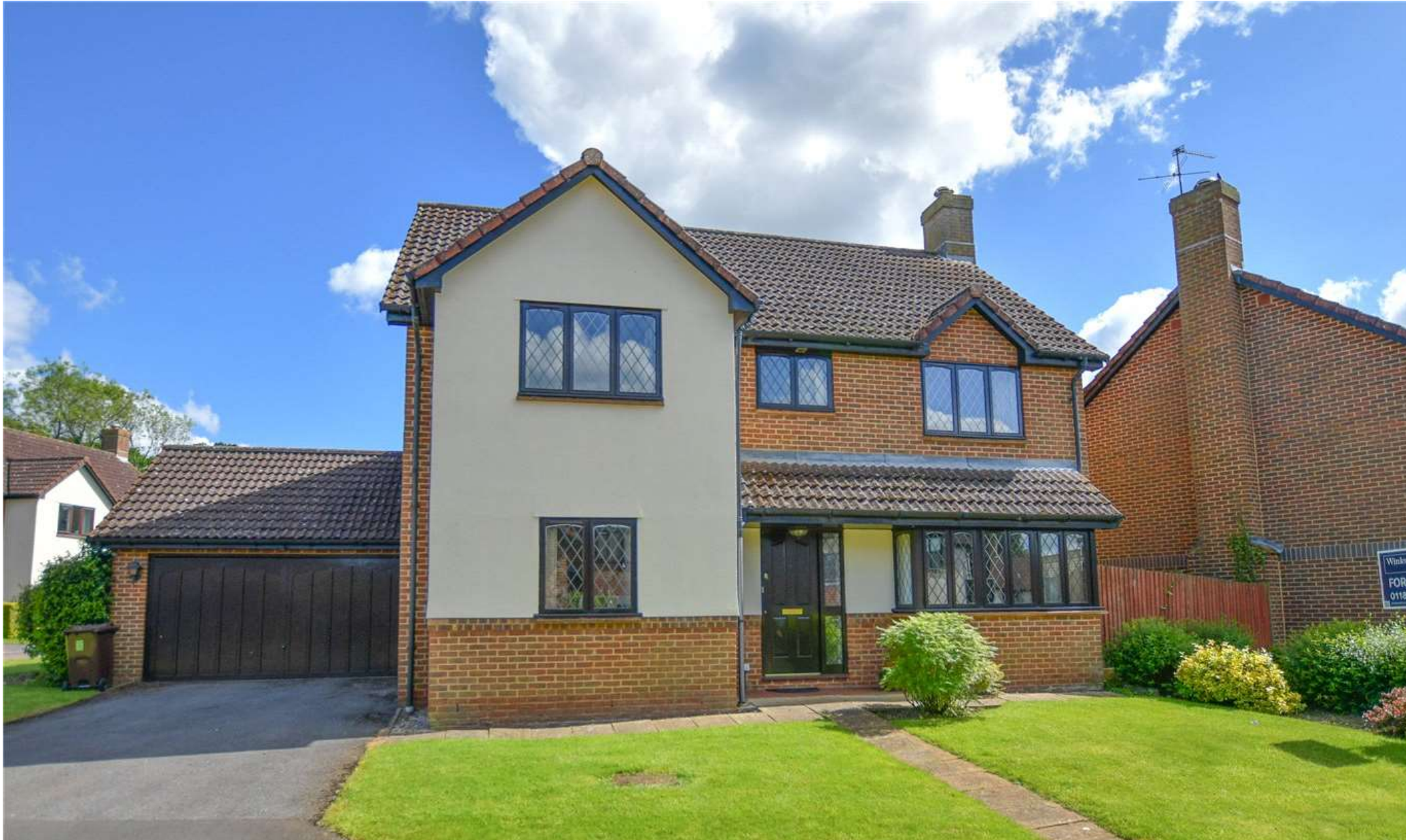
69 WOODWARD CLOSE, WINNERSH, WOKINGHAM, BERKSHIRE, RG41 5UU £750,000 FREEHOLD