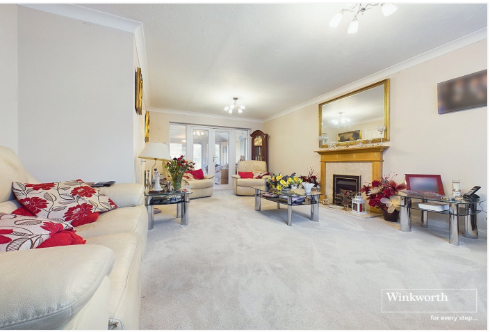
HIGH TREE DRIVE, READING, BERKSHIRE, RG6 1EU OFFERS IN EXCESS OF £780,000 FREEHOLD