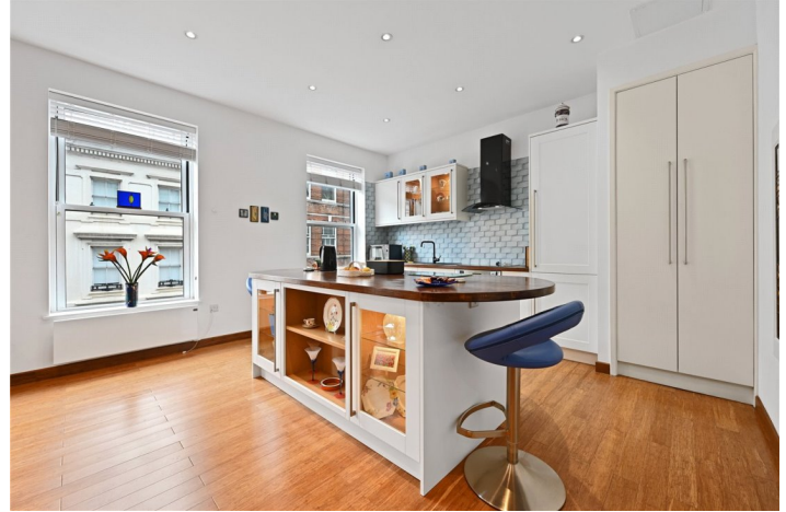
MUSEUM STREET, LONDON, WC1A £1,100,000 SHARE OF FREEHOLD

A DELIGHTFUL TWO BEDROOM, TWO BATHROOM APARTMENT IN VERY GOOD ORDER ON THE SECOND FLOOR OF A SMALL MODERN DEVELOPMENT SET IN A PRIME BLOOMSBURY LOCATION.