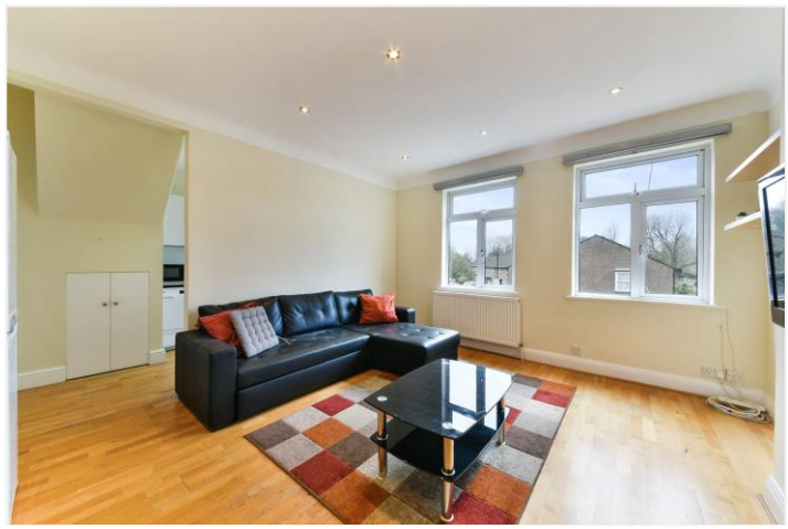
STATION PARADE, W4 £525,000 TO BE ADVISED