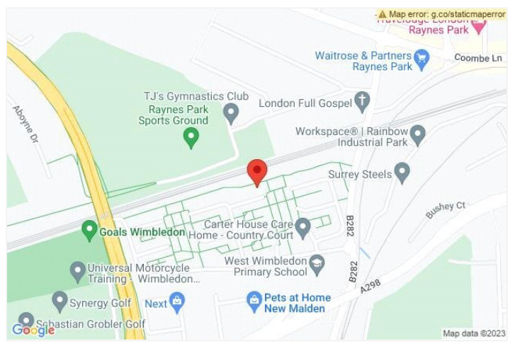
POLESDEN GARDENS, SW20 £265,000 LEASEHOLD

WINKWORTH WIMBLEDON ARE PLEASED TO PRESENT THIS LARGE ONE BEDROOM GROUND FLOOR APARTMENT WITHIN CLOSE PROXIMITY TO RAYNES PARK STATION AND LOCAL AMENITIES.